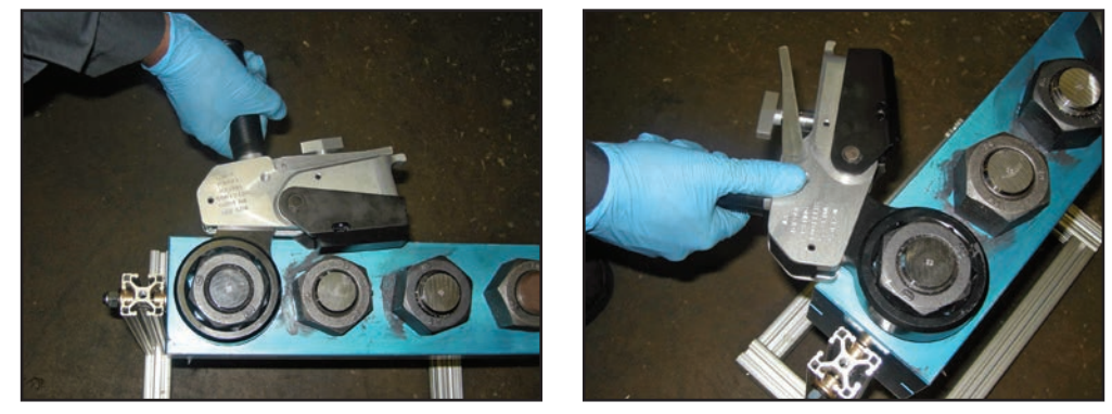
When loose, the wrench can be removed from the nut.

1. To remove the wrench after tightening, turn the adjustment knob approx. 1 <sup>1</sup>/<sub>4</sub> turns counter clockwise. Hold the handle and rotate the reaction foot until it makes contact with the reaction point. The position of the reaction foot will retract and loosen the backup wrench from the nut.