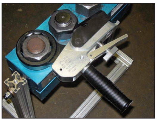
When loosening, the reaction foot will be located on the left side of the handle.

1. Prepare the backup wrench for tightening or loosening. During use, the handle of backup wrench will always be directed towards the user (see pictures below). The direction of rotation is determined from the position of the reaction foot.