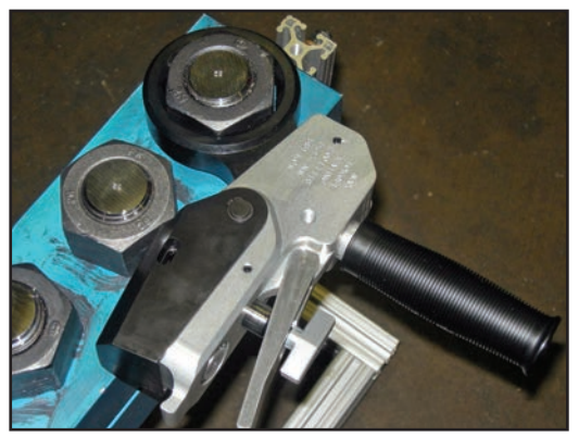
When tightening, the reaction foot will be located on the right hand side of the handle.